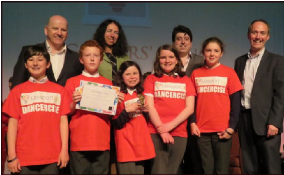
Engineer's Den—the Dancercise Team who were joint runners-up