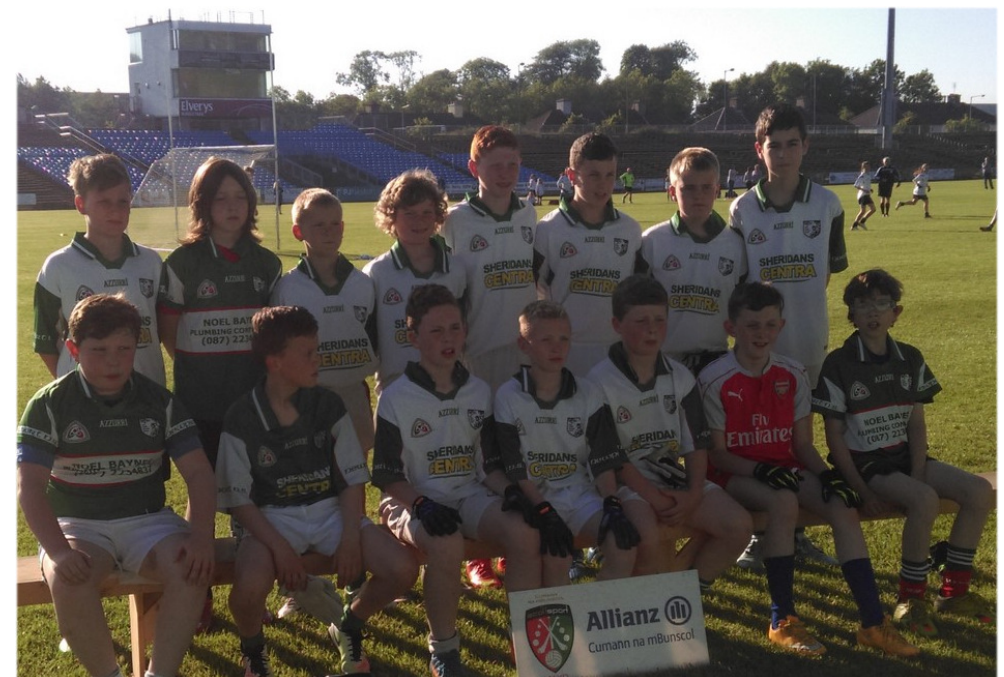
Boys Gaelic team pictured contesting the county final 2016 in McHale Park