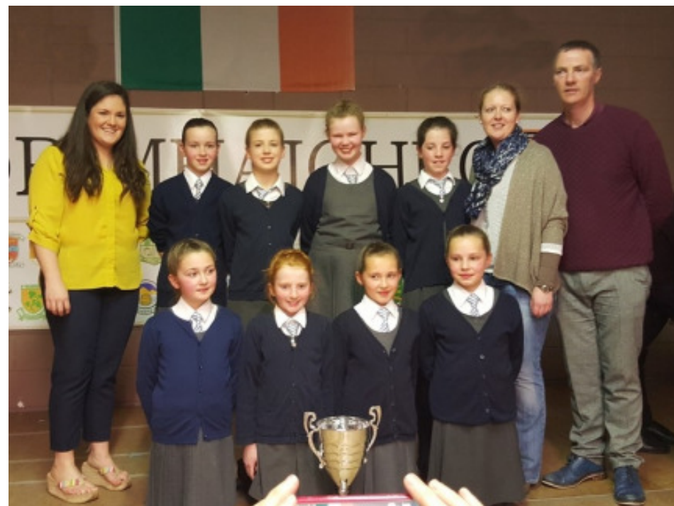
Scór na bPáistí Mayo Champions!