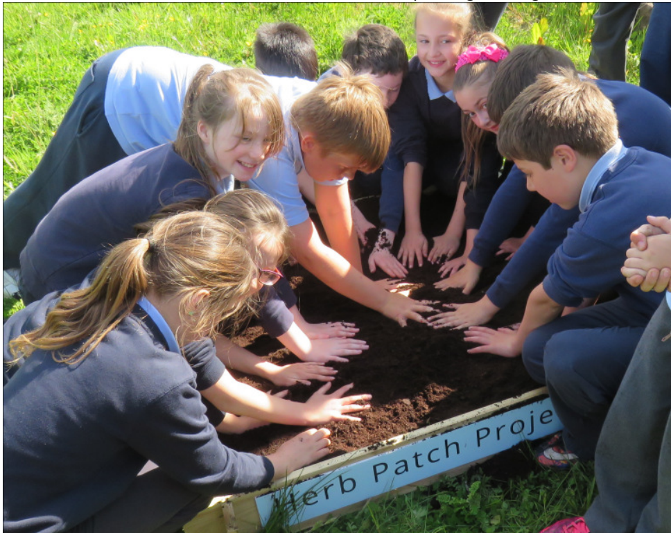
Ms Cheatle's class planting a herb garden at the GAP