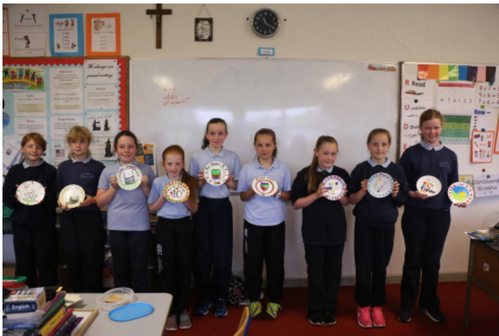
Plates decorated by 4th Class during their visit to Turlough House