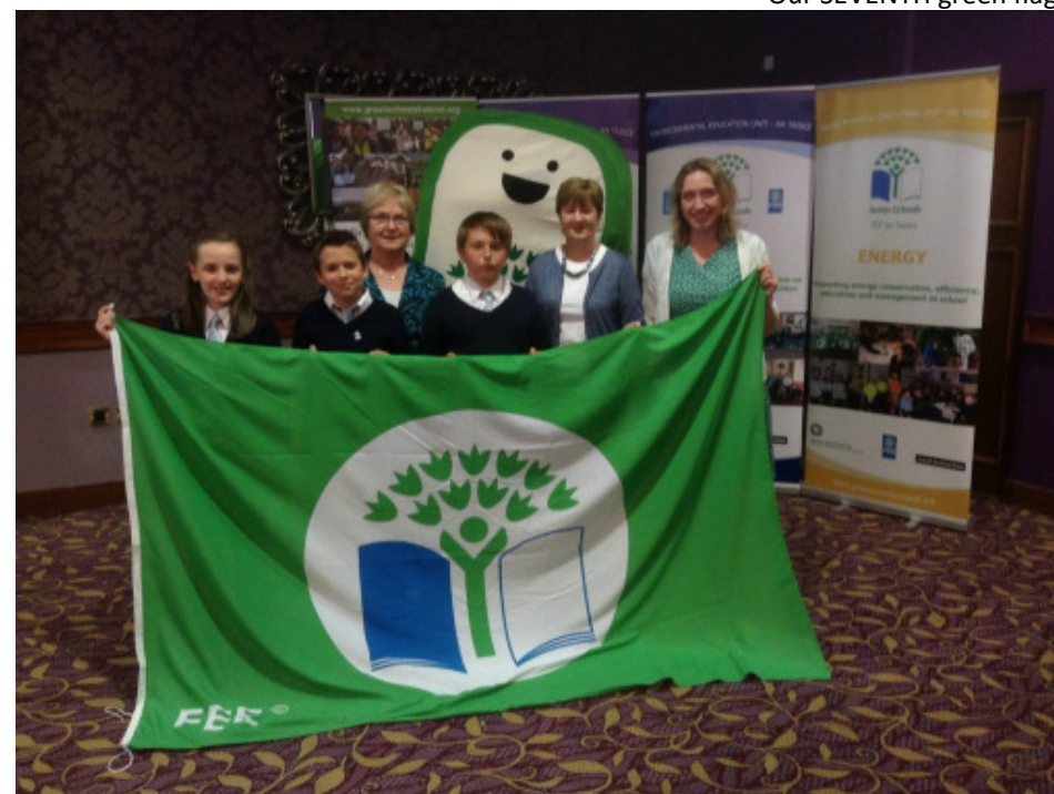
Our SEVENTH green flag